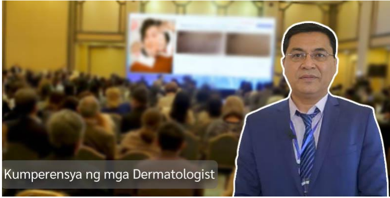
Kumperensya ng mga Dermatologist